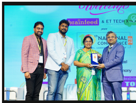
The Premia Academy awarded Top 500 Schools of India! at the Brainfeed School Excellence Awards

Pillar No. 102, 501 Karwan Sahu Road, Attapur, Hyderabad, Telangana 500008