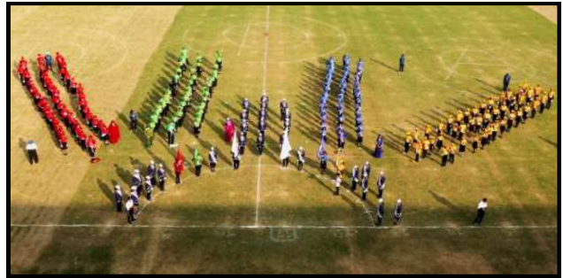
Assembly of the parade