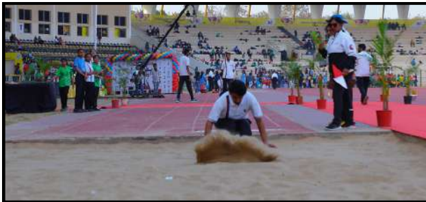
Seniors Long Jump