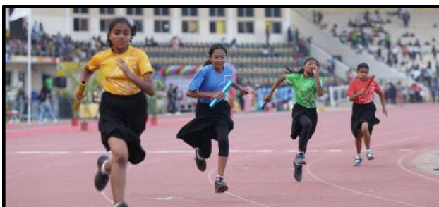
400m Relay Race