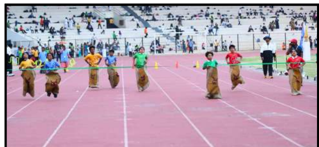
Grade III - Kangaroo Race