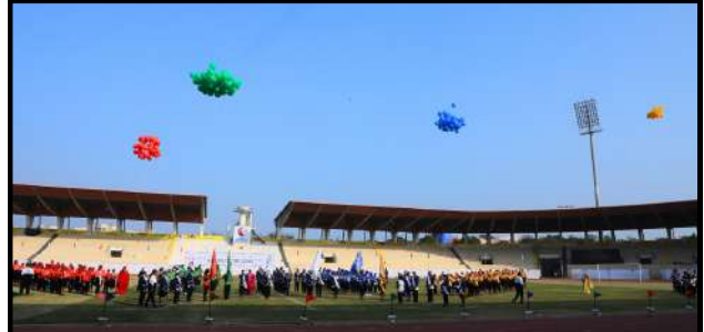
Colourful balloons representing the four houses!