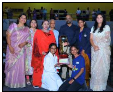
House Champions - Agni