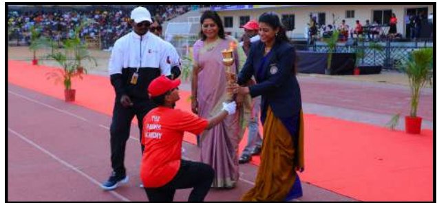
Torch relay by the achievers in sports