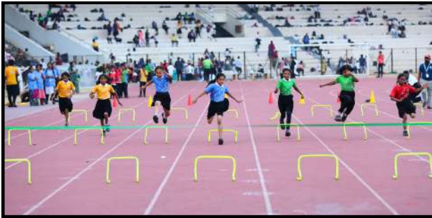
Grade IV - Hurdle Race