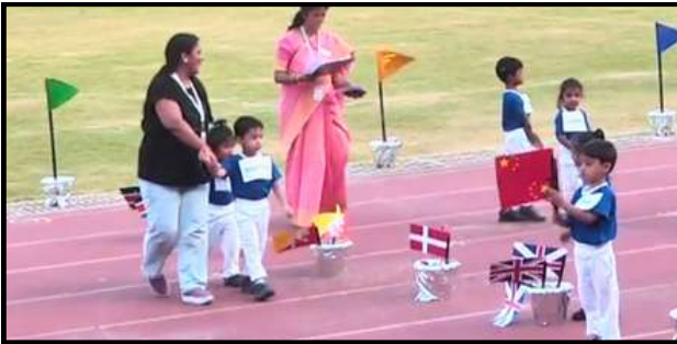
Nursery - Flag Race