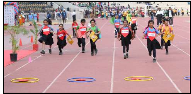
Grade II - It takes a village to RAISE a child