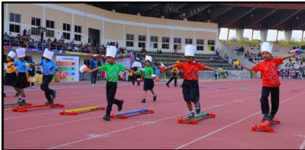
Grade I - Balancing the diet