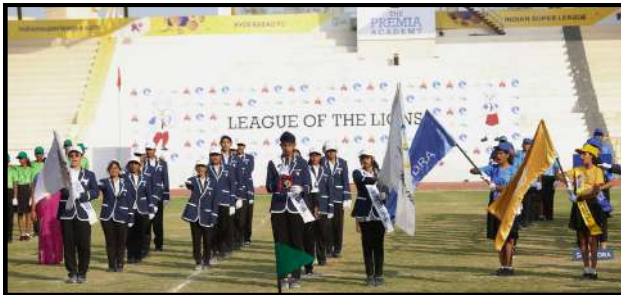
Oath taking by the student body