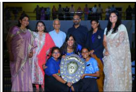
Best March Past - Samudra