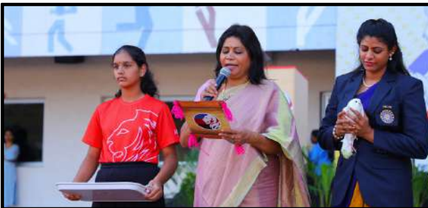
Declaring the sports meet open with the release of a pigeon!