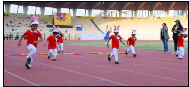
PPI - Rabbit & Carrot Race