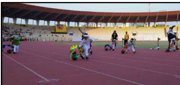
PPII - Young Gardeners running to protect the earth