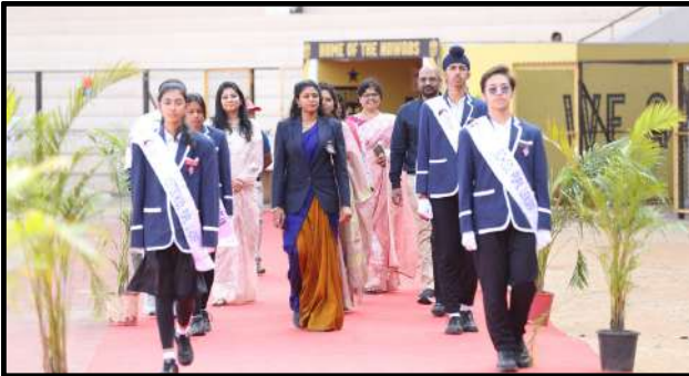
The Guard of Honour escorting the dignitaries